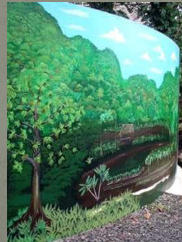
Water Tank Pictorial