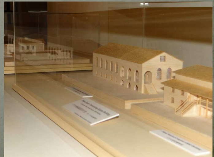
Japan Time Buildings model