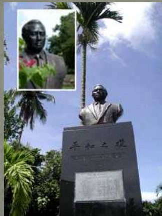
Haruo Remeliik Sculpture