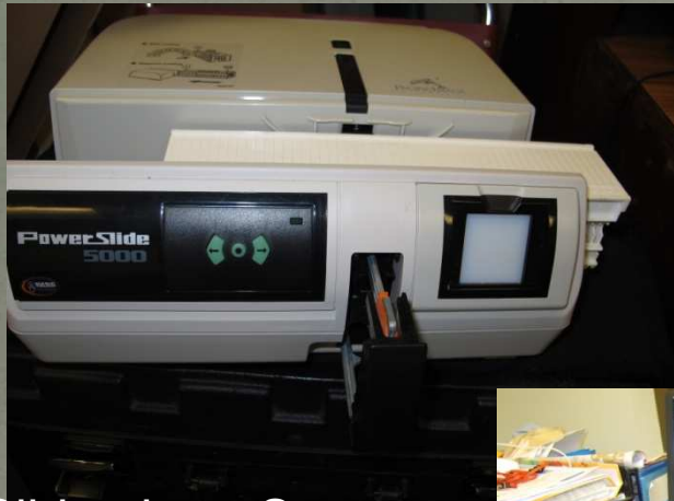
Slide photo Scanner