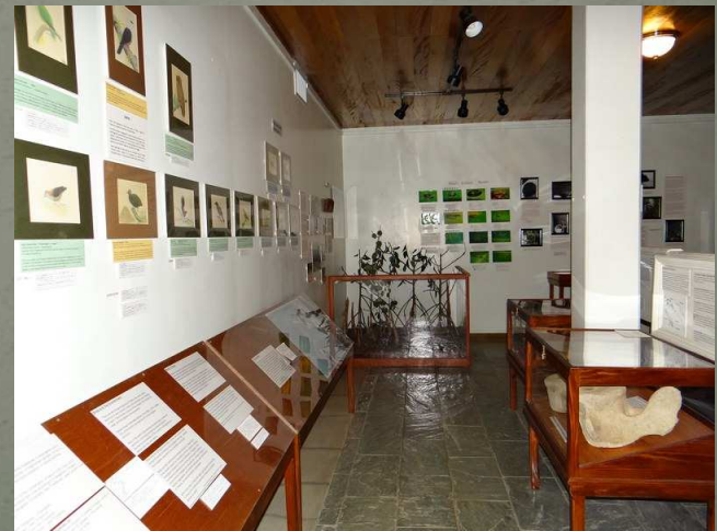
Natural history exhibition: