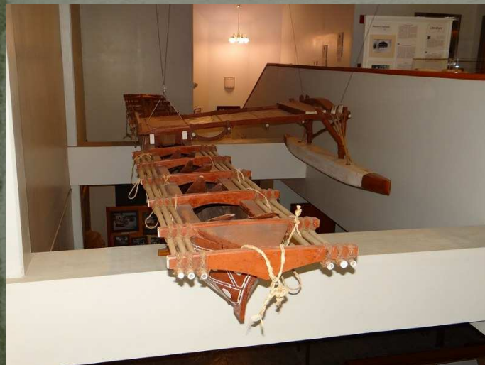
Traditional Canoe Model exhibition: