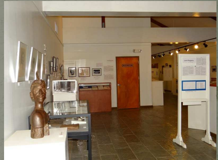
Japan Time exhibition: