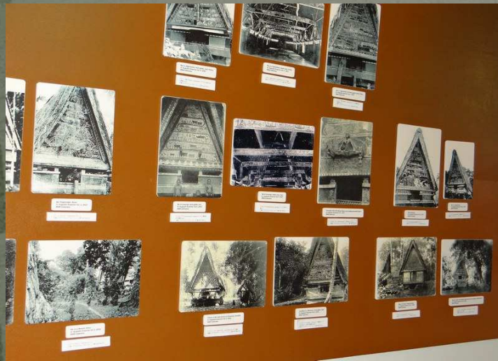
German Time exhibition: