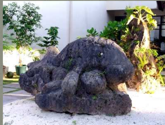
Mesekiu el Bad