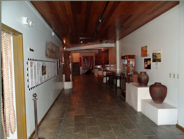
Palau through the years exhibition: