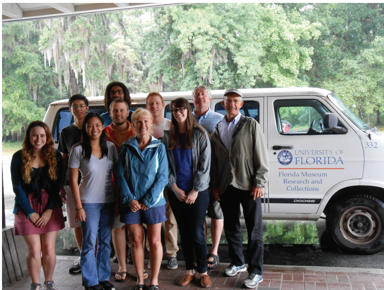
Figure 3. University of Florida undergraduate biology students on a museum field trip to collect plant specimens at the Ordway-Swisher Biological Station.

data. If they desire to do so, instructors can enhance the comparative component of the exercise by having different student groups focus on different plant species or conceptual issues. By coordinating with other instructors to conduct this exercise simultaneously at multiple institutions, students from different programs can interact online to enhance learning, foster interactions, and develop a collective and more collaborative perspective on scientific problem solving.